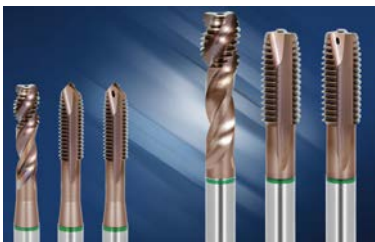
Image caption: The GARANT MasterTap is the latest member of the "GARANT Master" product family.

Image caption: The new GARANT MasterTap achieves outstanding results in a wide range of materials, including steel, stainless steel, aluminium, brass and cast iron.