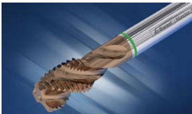
Image caption: The new GARANT MasterTap achieves outstanding results in a wide range of materials, including steel, stainless steel, aluminium, brass and cast iron.

The new GARANT MasterTap is the latest tool in the "GARANT Master" product family of high-performance tools. The product family already includes two solid carbide drills, GARANT MasterSteel SPEED and FEED, a classic four-bladed milling cutter, and the GARANT MasterSteel SlotMachine, GARANT MasterSteel PickPocket solid carbide mills and the GARANT MasterSteel finishing cutters. With these the Hoffmann Group offers state-of-the-art high-performance tools for every application.