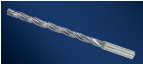
Image caption: The new GARANT MasterSteel FEED solid carbide drill with the world's largest L/D ratio and three cutters, generates up to 50 percent more feed per rotation and offers particularly long tool life.

The new GARANT MasterSteel FEED with 8xD and 12xD are now available for a diameter of 4 to 20 millimetres. The tools can be ordered from the Hoffmann Group E-Shop and from the new 2017/2018 catalogue.