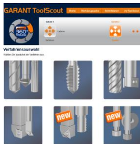
Image caption: The GARANT ToolScout has been enhanced with two new services: GaugeScout enables users to precisely select their measuring tools, while ThreadScout helps to select tools for thread cutting and thread milling.

In addition, Hoffmann Group has expanded the corner milling option in the MillingScout to include the TPC milling (dynamic) process. This enables the user to determine the values required for NC programming, such as the maximum cutting thickness h_{max} .