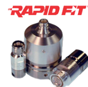
RAPID FIT™ Connectors

Radio Frequency Systems line of high performance coaxial cable connectors are designed specifically to provide the highest quality connector-cable interface while simplifying and speeding up the attachment of connectors to CELLFLEX® coaxial cables. RFS connectors are fully tested for mechanical and electrical compliance specifications. They are available in all popular cable sizes in a variety of mating interfaces. The N connector is one of the most common RF connector types. N type connectors from RFS will be delivered with a non-slotted outer conductor contact sleeve and a special gasket. Due to a special design of the coupling nut (without spring ring) N connectors can be tightened with increased torque. This increases the contact pressure.