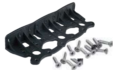
-TRIO- wall bracket