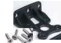
-S- wall bracket