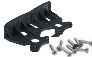
-DUO- wall bracket