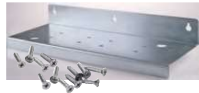
-T- wall bracket CODE RB7401010