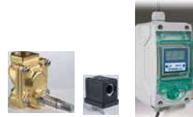
-KIT AUTO- for S models CODE RE7120024 automatic discharge kit (see pages 186-187)