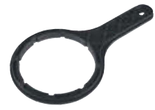
-X- spanner CODE RB7403017