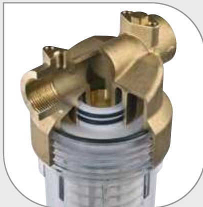
BX cartridges with 45 mm double o-ring collar. Quick-fit connection for a perfect tightening.