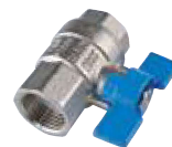
brass discharge ball-valve with gasket