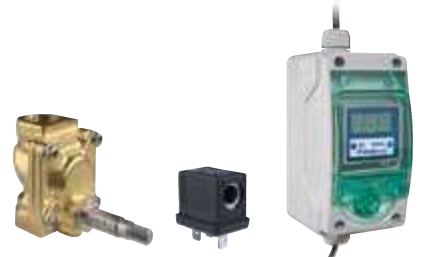
-KIT AUTO- for S models CODE RE7120024 automatic discharge kit (see pages 186-187)