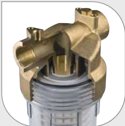
SX cartridges with standard flat seals.

K DP housings are manufactured with the finest and most advanced materials under constant focus on innovative processing technologies and ceaseless modernization to ensure the absolute quality of our products.