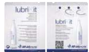
-LUBRIKIT- single-dose lubricant for housing o-ring CODE RE9020650