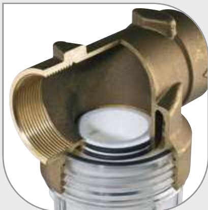
CX cartridges with 57 mm double o-ring collar. Quick-fit connection for a perfect tightening and designed to suit to large water flow.