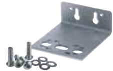
-K DP- wall bracket CODE RB7400021