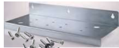
-T- wall bracket CODE RB7401010