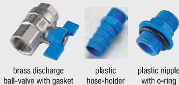
brass discharge ball-valve with gasket