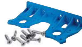
-D- wall bracket CODE RB7400009