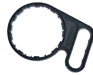
-U- spanner CODE RB7403013