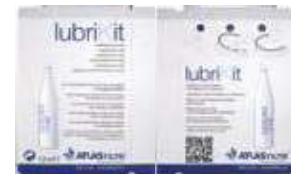
-LUBRIKIT- single-dose lubricant for housing o-ring CODE RE9020650