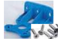
-S- wall bracket CODE RB7400007