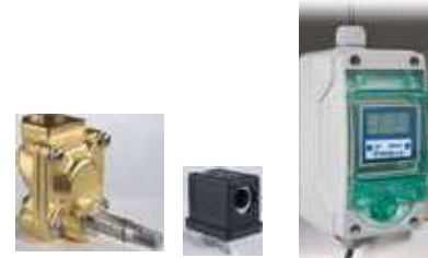
-KIT AUTO- for S models CODE RE7120024 automatic discharge kit (see pages 186-187)