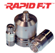
RAPID FIT™ Connectors

Radio Frequency Systems line of high performance coaxial cable connectors are designed specifically to provide the highest quality connector-cable interface while simplifying and speeding up the attachment of connectors to CELLFLEX® coaxial cables. RFS connectors are fully tested for mechanical and electrical compliance specifications. They are available in all popular cable sizes in a variety of mating interfaces. The N connector is one of the most common RF connector types. N type connectors from RFS will be delivered with a non-slotted outer conductor contact sleeve and a special gasket. Due to a special design of the coupling nut (without spring ring) N connectors can be tightened with increased torque. This increases the contact pressure.