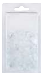
POLYPHOSPHATE CRYSTALS 6/10 (small) 160 g blister, refill TO DOSAL.