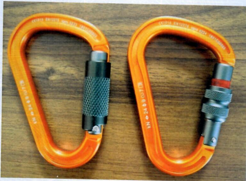
Screw gate (art. vpro 0224)